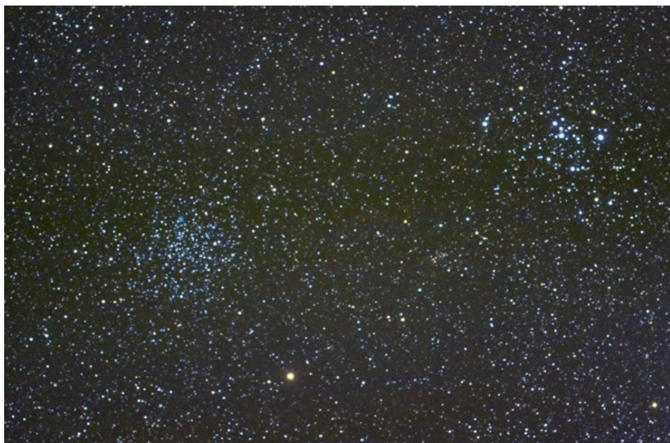
M-46 and M-47

Now it's time to move south of the celestial equator for the last five Messier objects. Find Sirius and look for \theta Canis Majoris, a 4th magnitude star about 5° to the NNE; then go another 4.5° NE, which should put you about a third of the way from Sirius to Procyon in Canis Minor. Any pair of binoculars should show you a small fuzz ball at that position and it might be visible to the naked eye under the very best of conditions. This is M-50 (NGC 2323) which has a combined magnitude of 6.3. Most telescopes will show a moderately compressed open cluster with several arcs of curving stars which, many suggest, make the group look like a heart. Most of the stars are blue and white points but there is one red