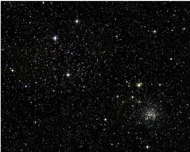
M-35 and NGC 2158

This will be a month of relatively southerly objects, beginning in Gemini at about +24. M-35 (NGC 2168) is a particularly beautiful and distinctive open cluster. A good way to find it is to return to M-1, described last month. M-35 is a little over 2° north and about 8° east of the supernova remnant. Alternatively, it’s about 2.5° NW of \eta Geminorum. This one is the size of the full moon, so limit your power to 50 or thereabouts. There are long, curving rows of bright stars radiating out from the center, which are superimposed on a background of fainter stars. Dark lanes divide the cluster into three parts. It’s a true showpiece. Just to the SW is NGC 2158 . This 11th magnitude cluster is small, and considerably more distant than its showy, apparent