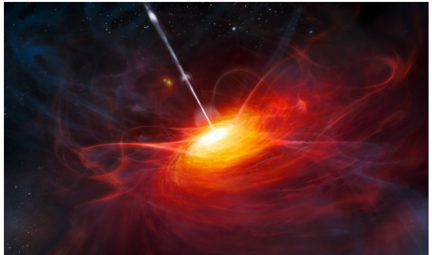
Artist's rendering of the accretion disk in ULAS J1120+0641, a very distant quasar powered by a black hole with a mass two billion times that of the Sun.

But there still remained the concern that we are looking far away at something small, but insanely bright.